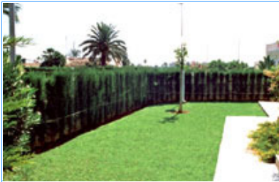
Front entrance with garden.