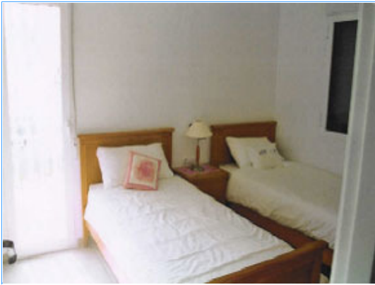
Second bedroom - with twin beds and a large built in wardrobe.